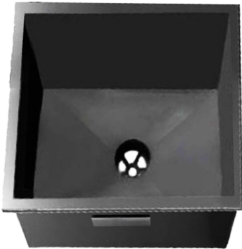
1 bowl sink

Laboratory sink for recessed in counter installation, 10 mm (3/8 in) thick, black polypropylene, 38 mm (1½ in) rim, and 38 mm (1½ in) integrated drain assembly situated center of bowl.