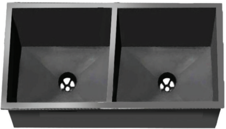
DUAL BOWL MODEL