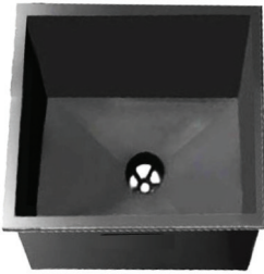
SINGLE BOWL MODEL

Laboratory sink for undermount installation, 10 mm (3/8 in) thick, black polypropylene, 38 mm (1½ in) rim, 38 mm (1½ in) integrated drain assembly situated center of bowl.